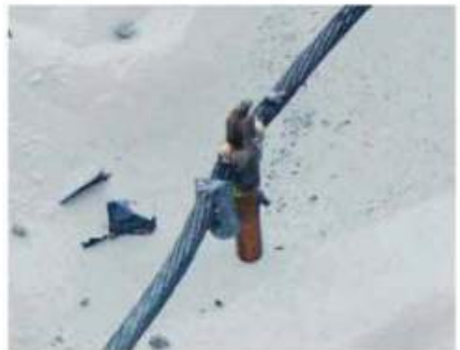
Fig 2. Questionable weld connection

The assembly process for a StSt clamping system consists of mechanical fitting, alignment and then bolting connections. If the work pieces are misaligned, the fittings can be loosened, adjusted and tightened to the final torque specifications. The entire process of making the joint takes about the same time as replacing a bicycle tire. The assembly process is intrinsically repairable. The site work preparation includes all of the layout, measuring and trenching to place the metal grounding materials into the soil, but that's where the similarities between welding and clamping end