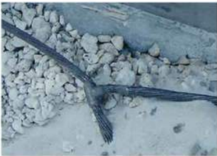
Fig 1. Welded joint grounding system

That is to say, the combustion of copper thermite using copper oxide and aluminum powder creates a welded joint plus lots of heat and smoke.